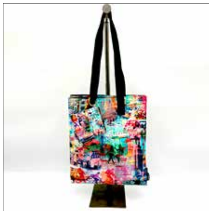
L-shaped Countertop Tote display

Recommended display for Large Fringe, Silk and Bandana scarves