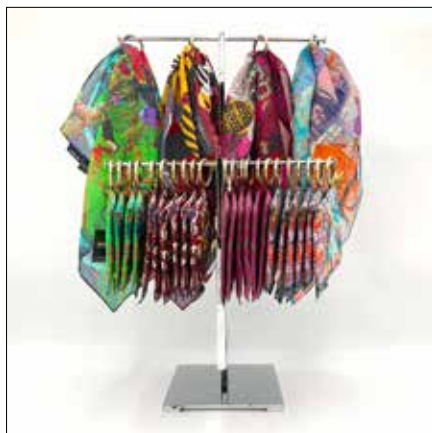
2 Tier Adjustable T-bar

Recommended for display for our Mini Pouch