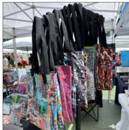
2-way Standing Rack

Recommended for display for our Bandana and Mini Pouch