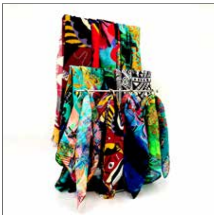
3 Tier Adjustable T-bar

Recommended display for Large Fringe, Silk and Bandana scarves